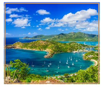
ROYALTY PRIVATE LAND TOUR Private Tour: $170 (Per Hour)

Barbuda Flights Prices Available Upon Request Private Charters Available Upon Request.