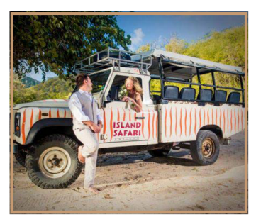
TROPICAL ADVENTURES ANTIGUA - LAND TOURS